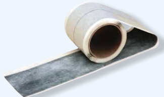
437299 Strip RL 80 S