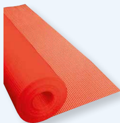
437094 RASOLASTIK NET