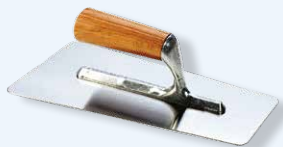
Smooth stainless steel trowel