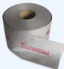
437337 Strip RL 120