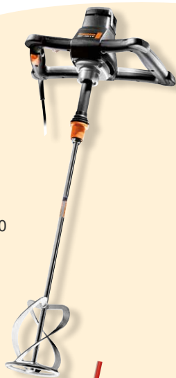
437145 Blender 1200