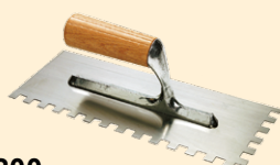
437200 28x12 cm trowel stainless steel 10 mm square serrations