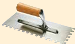
10x10 mm trowel