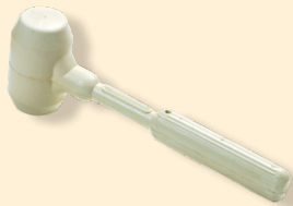
White rubber mallet