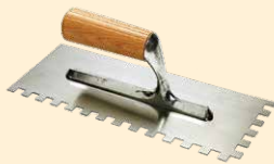
28x12 cm trowel stainless steel 10 mm square serrations